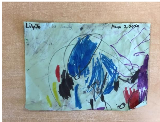
Figure 1 First drawing of a car created by a LilyJo

We invited the children to create drawings of cars as a means to show their current knowledge of cars.