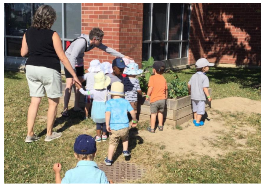
Figure 8 - The class discovering and exploring another vegetable garden.

While continuing to investigate the questions that the children and educators originally posed, it was time for them to learn about the different types of gardens. They already had preexisting knowledge about vegetable gardens, since they had one in their playground. The class decided to go for a walk to see what other gardens they could find! While on their walk, they discovered another vegetable garden by the main entrance of John Sweeney Catholic school. While exploring the community, they also found a rock garden and a flower garden!