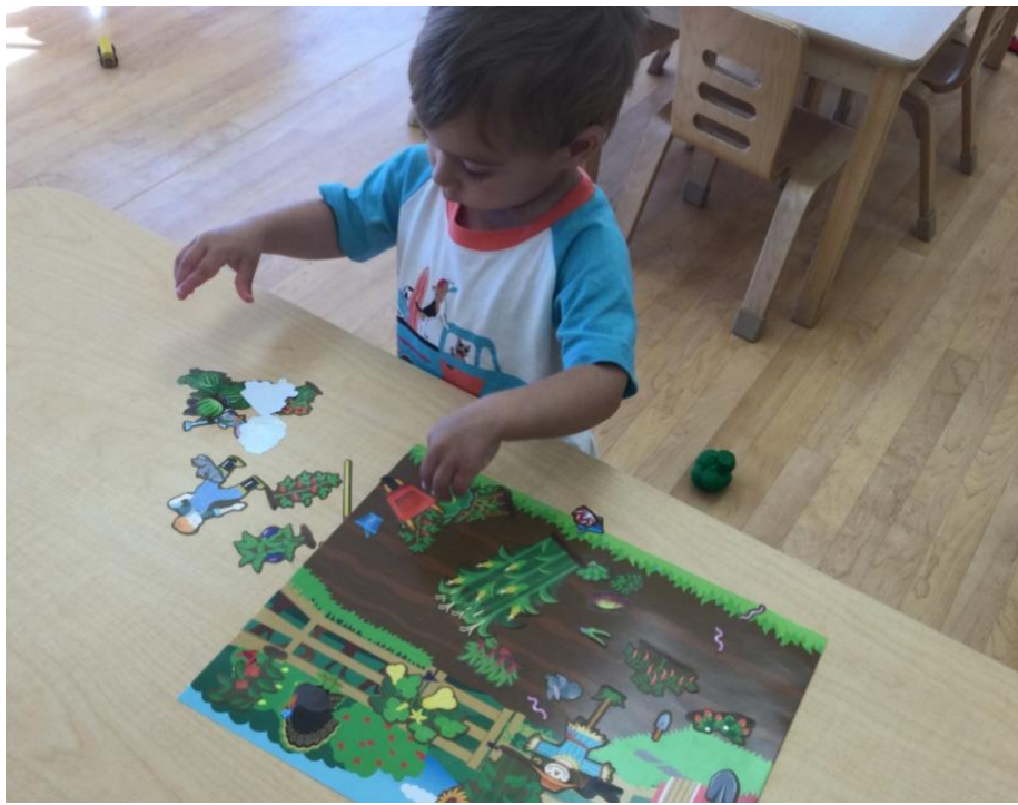
Figure 1 - Thomas using the farm themed reusable sticker sheet.

The garden project was initiated by the children throughout the early days of June, when the children were becoming more eager to explore the gardens in our playground. Educator Debbie brought in a few reusable sticker sheets that were garden and farm themed. Natalie, Thomas and Fox helped place the stickers onto the sheet. Some of the stickers represented different vegetables and tools used in the garden.