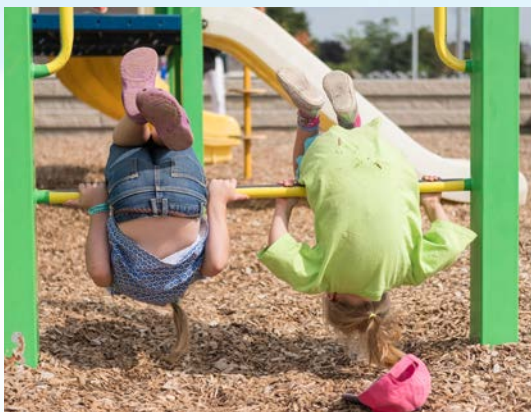
Children hang upside down at a playground; this is orientation