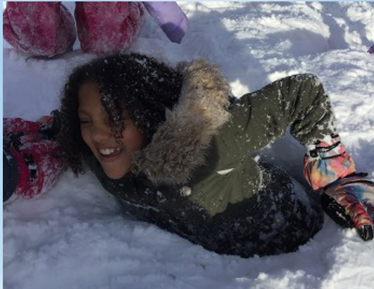
A child digs a hole in the snow and sits in it; this is enclosing

Mother Nature and other elements provide an environment that becomes the teacher. Think of learning through the lens of schemas.