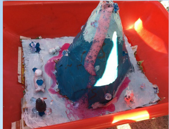
A group mixes vinegar and baking soda to make an eruption; this is transformation