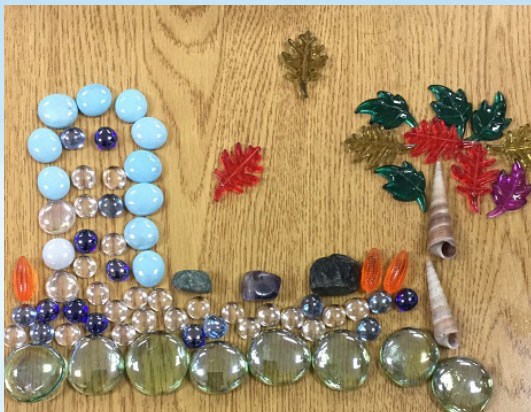
A child makes a transient art masterpiece; this is positioning