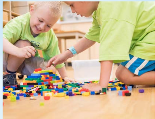
Children build a structure with Lego®; this is connection