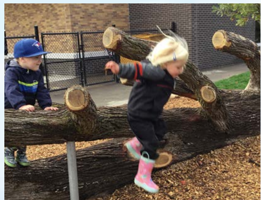
A child jumps from a log; this is trajectory